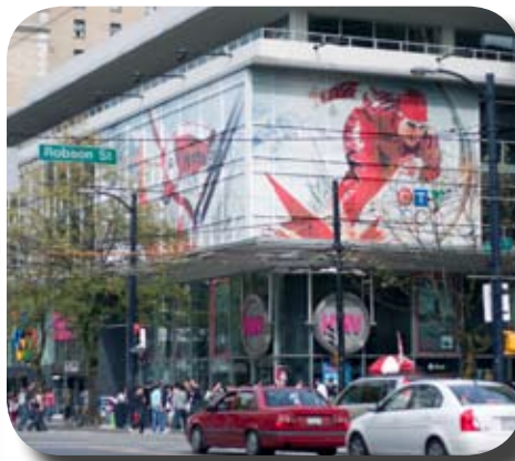
This giant glass graphic for CTV has won the award for the best outdoor graphic project in Canada by SignMedia magazine.