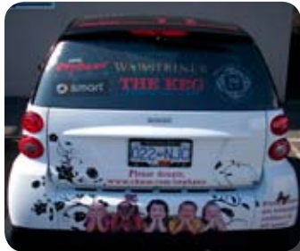
A wrapped Smart Car for the CKNW Orphans' Fund Smart Car Lottery at Thunderbird Show Park event.