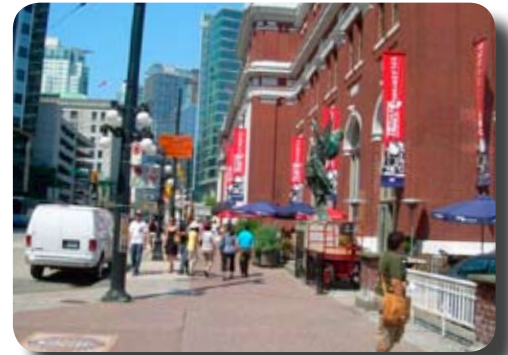
Steamworks Gastown had their outdoor banners freshened up.