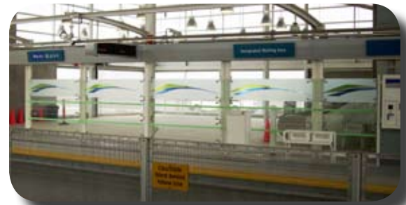
Partition glass graphic installed at the Canada Line Templeton Station.