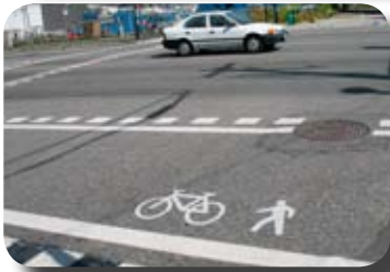
More bike lanes: 300 sets of bike lane signs were produced for the City of Vancouver.