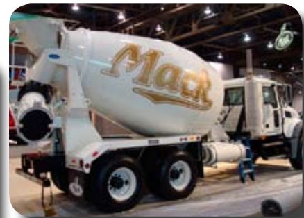
Fleet graphic for Mack Trucks shines at a tradeshow.

Tel: 604.472.3800 Fax: 604.944.4017 www.ampcomfg.com durablegraphics@ampcomfg.com