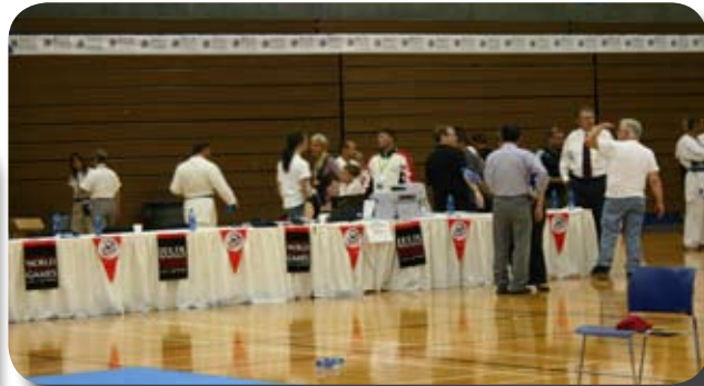
Plastic Banners on wall;