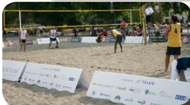
Sponsor Boards on Coroplast