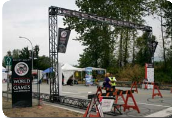
Outdoor gate at Burnaby Lake Sports Complex.

As the Official Supplier, Ampco Grafix produced banners, signage, flags and other graphics used for event ceremonies, venues and streets in Metro Vancouver.