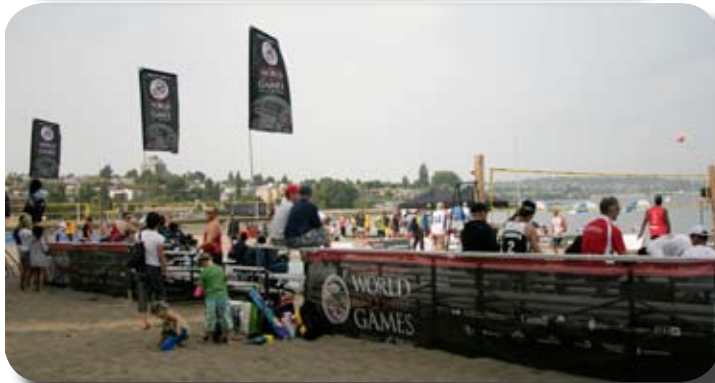
Fabric Flags; Scrim Banners